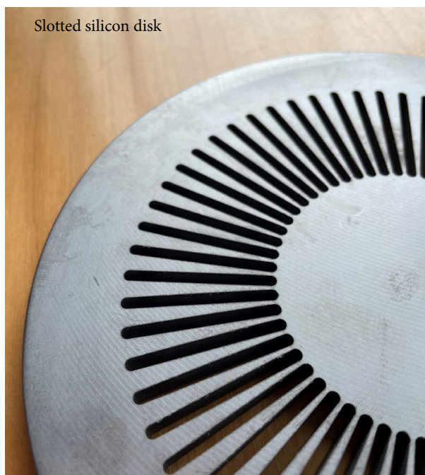
Slotted silicon disk

By 2001 the number of employees had grown to 15 and a new market opened up when Synova launched the LCS (Laser Cutting System) 300. The 3-axis LCS 300 (working