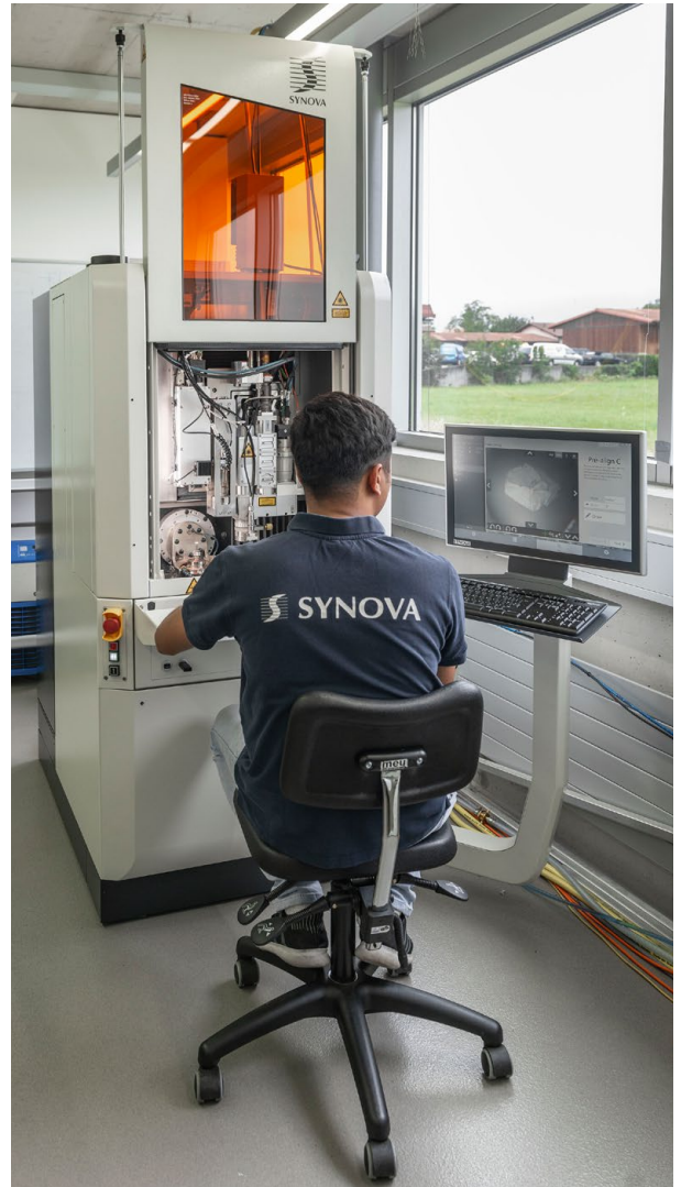
Final test of the DCS 50

Launched in 2014, the LCS 50 was an instant hit. The DCS 50, a machine version for the diamond market, became the optimal system for cutting diamond stones. Synova now had a versatile machine for the precision micro-machining of small components.