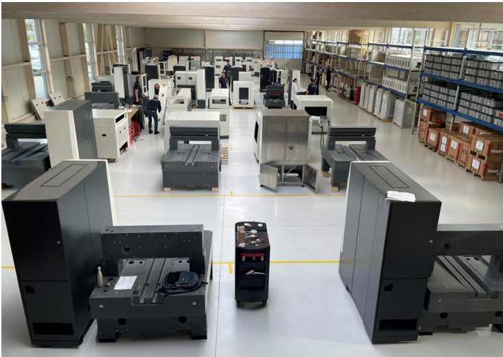
Synova's assembly hall

table size of 300 x 300 mm) was suited for a variety of precision machining applications. A milestone in the company's history took place when machine '012', the first LCS 300, was shipped in August 2001 to a job shop in Germany. The LCS 300 would become the company's workhorse. Most of the 13 LCS 300 systems shipped in 2002 were to customers in Germany, Japan, South Korea, Taiwan and USA.