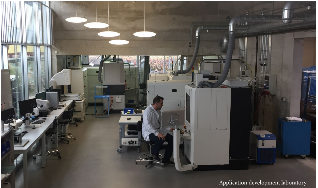
Application development laboratory

of laser and water to drill tooth enamel. The laser beam was guided by total reflection within a fine water jet in the manner of an optical fibre. The laser provided the heat for ablation while the water cooled the material. This water jet guided laser offered the advantage of a parallel cylindrical laser beam, meaning without any beam divergence that is inherent in other laser processes.